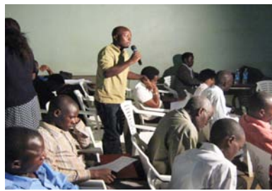
Members discussing issues during the annual general meeting of 2011 held at the Uganda museum in Kira Road Kamwokya, Kampala

In this issue we report to you details on changes that have taken place in the last one year.