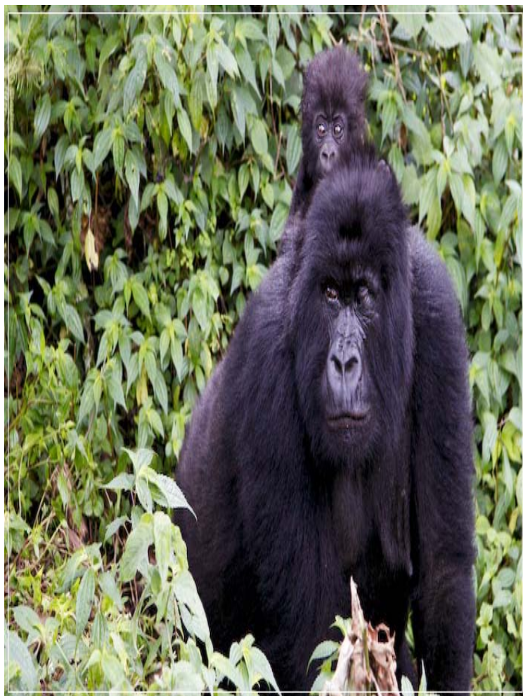
As a member of Uganda Wildlife Society you will enjoy a fulfilling satisfaction in knowing that you are enabling wildlife conservation for our own survival and those of our future generations.