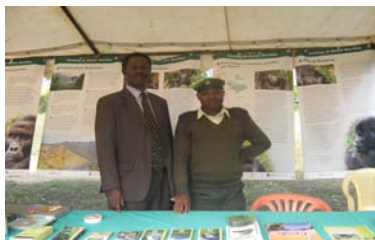
Uganda Wildlife Society stall at the environment and biodiversity day in Kanungu on June 5, 2010.