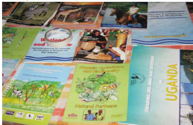
Some of the publications on oil and gas issues. These publications are available at UWS secretariat library for the interested public.

Our findings reveal oil and gas derivation funds establishment is feasible in Uganda and could be integrated within the framework for national petroleum fiscal system.