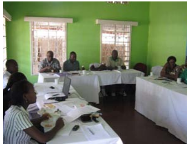
One of the strategic planning meetings held in Kampala before the 2011 annual general meeting.