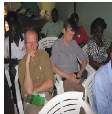
Some of the stakeholders engaged in the EGP/IUCN- NL project supporting civil society coalition and advocacy for good governance in mining and extraction industry in Uganda.

Funded by Ecosystem grants Program/International Union for conservation of Nature Netherlands (EGP/IUCN- NL), this project aims to establish an Albertine Rift regional civil society coalition to advocate for good governance in the mining and extraction industry.