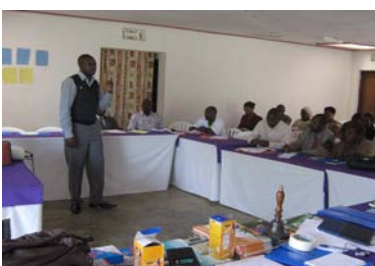
Uganda Wildlife Society workshop on climate change in Kanungu on 23rd of April 2011.