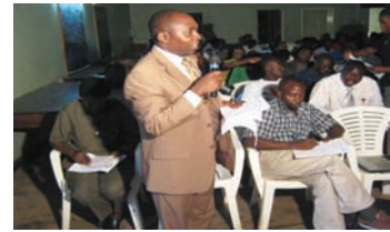
Stakeholders of COBWEB, engage in one of the public talks related to the project.

Extending wetland protected areas through community conservation initiatives (COBWEB) project aims to establish and strengthen community based regulations and sustainable resource use in wetlands with important biodiversity.